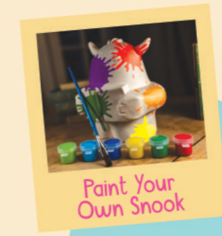
Paint Your Own Snook

Our exciting goodies are sure to unleash your creativity!