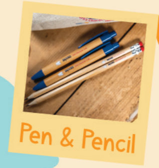
Pen & Pencil